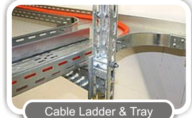
Cable Ladder & Tray