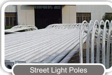
Street Light Poles