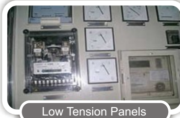
Low Tension Panels