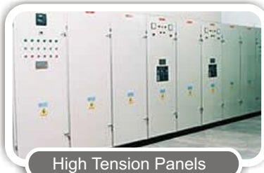
High Tension Panels