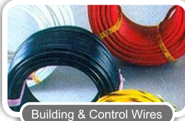
Building & Control Wires