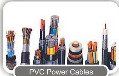
PVC Power Cables